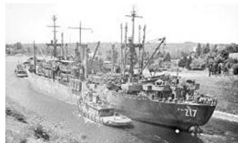
USS New Kent in Houghton, WA Jun 45; E.J. is aboard

On 15 MAR 45 New Kent departed Guadalcanal, stopped briefly at Ulithi , and arrived off the western beaches of Okinawa on the morning of 1 APR 45. Landing her troops that afternoon, she sent a beach party ashore the next day and remained in the transport area, subject to frequent enemy air attack, until 7 APR when she departed for Guam and then Pearl Harbor, arriving on 23 APR.