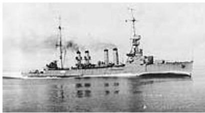
Marby at full speed.