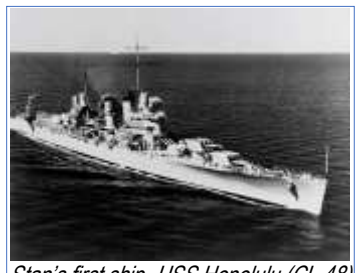
Stan's first ship -USS Honolulu (CL-48)

1940 as an EM3c and she continued to operate out of Long Beach, CA and following an overhaul in the Naval Shipyard there, she was reassigned to Pearl Harbor, TH in NOV 1940.